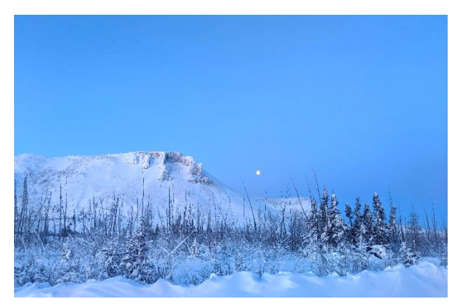
A full moon over the east end of Bear Rock, January 2020.

pc.tulitainfo-infotulita.pc@canada.ca 867-588-4884 www.parkscanada.gc.ca/naatsihcboh